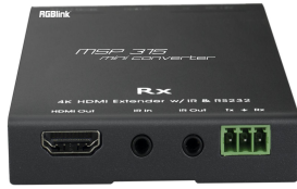
MSP 315-4 RX