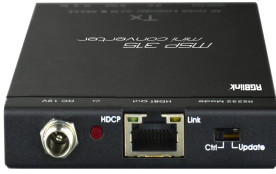
MSP 315-4 TX