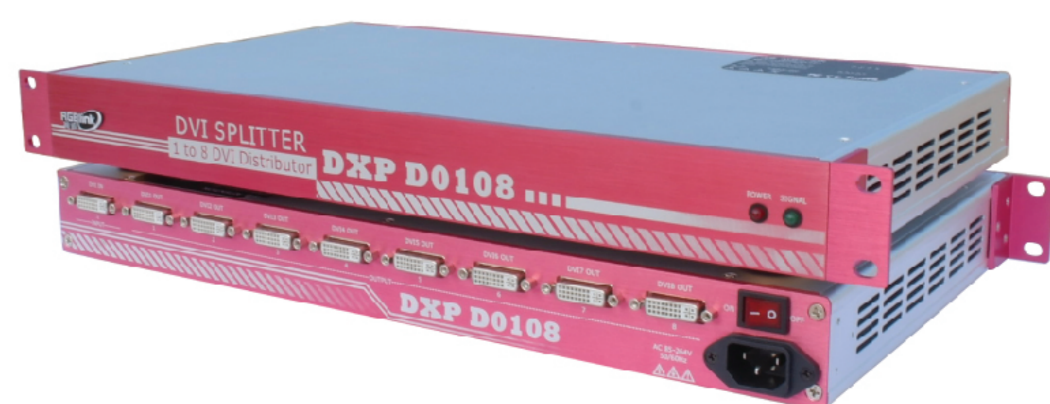
DXP D0108 DVI 1 in 8 out Distributor

More detail, please visit www.rgblink.com