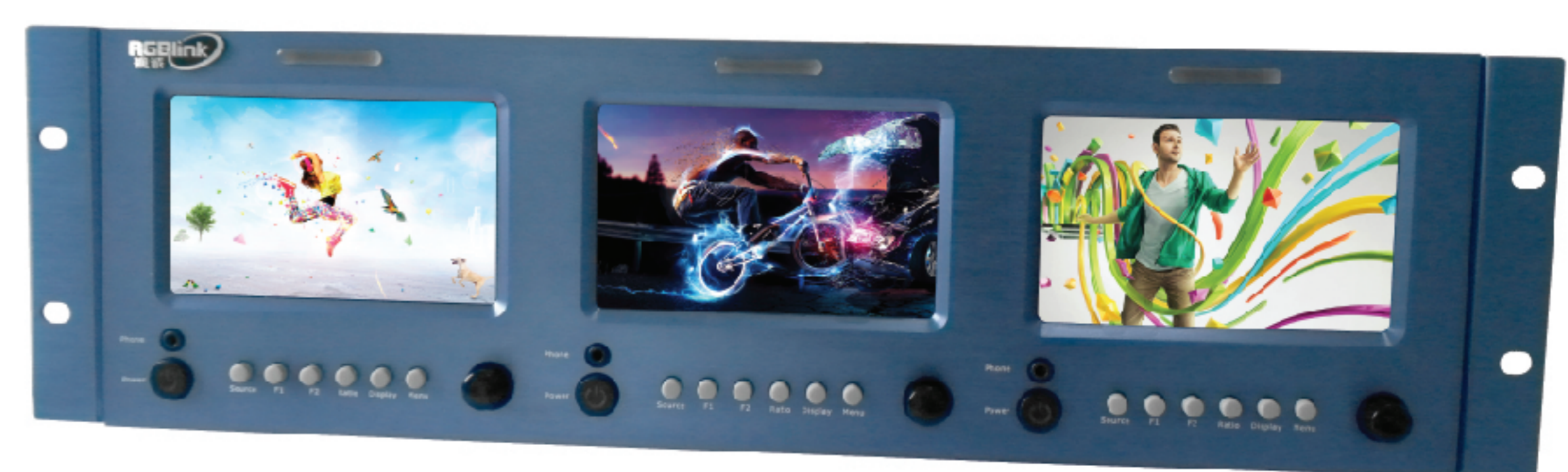
RMS 5533S Rack Mount Monitor