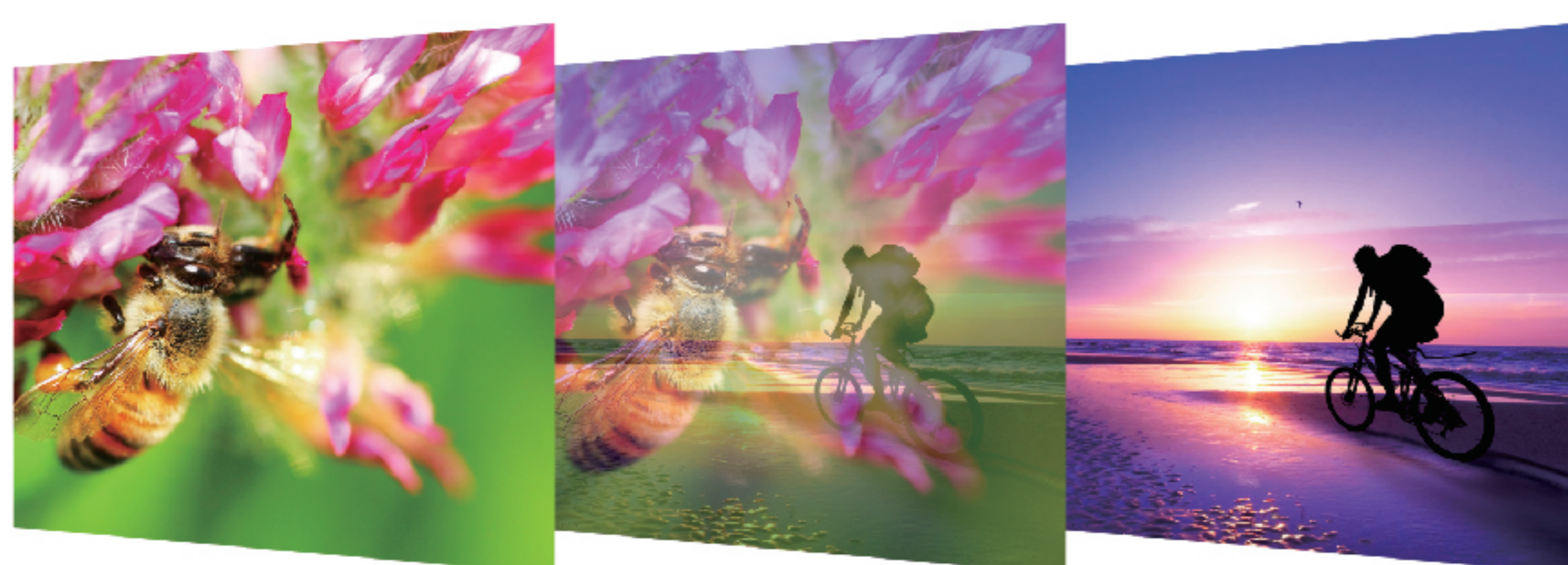
Fade in Fade out transition

VSP 168S supports following main functions: max output resolution up to 2048 x 1152 or 2560 x 816, quick user config scale operation, seamless switching for the inputs, auto input detect, multiple cascade mapping.